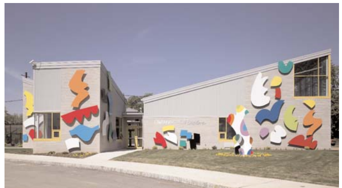
Top: View of building and pool